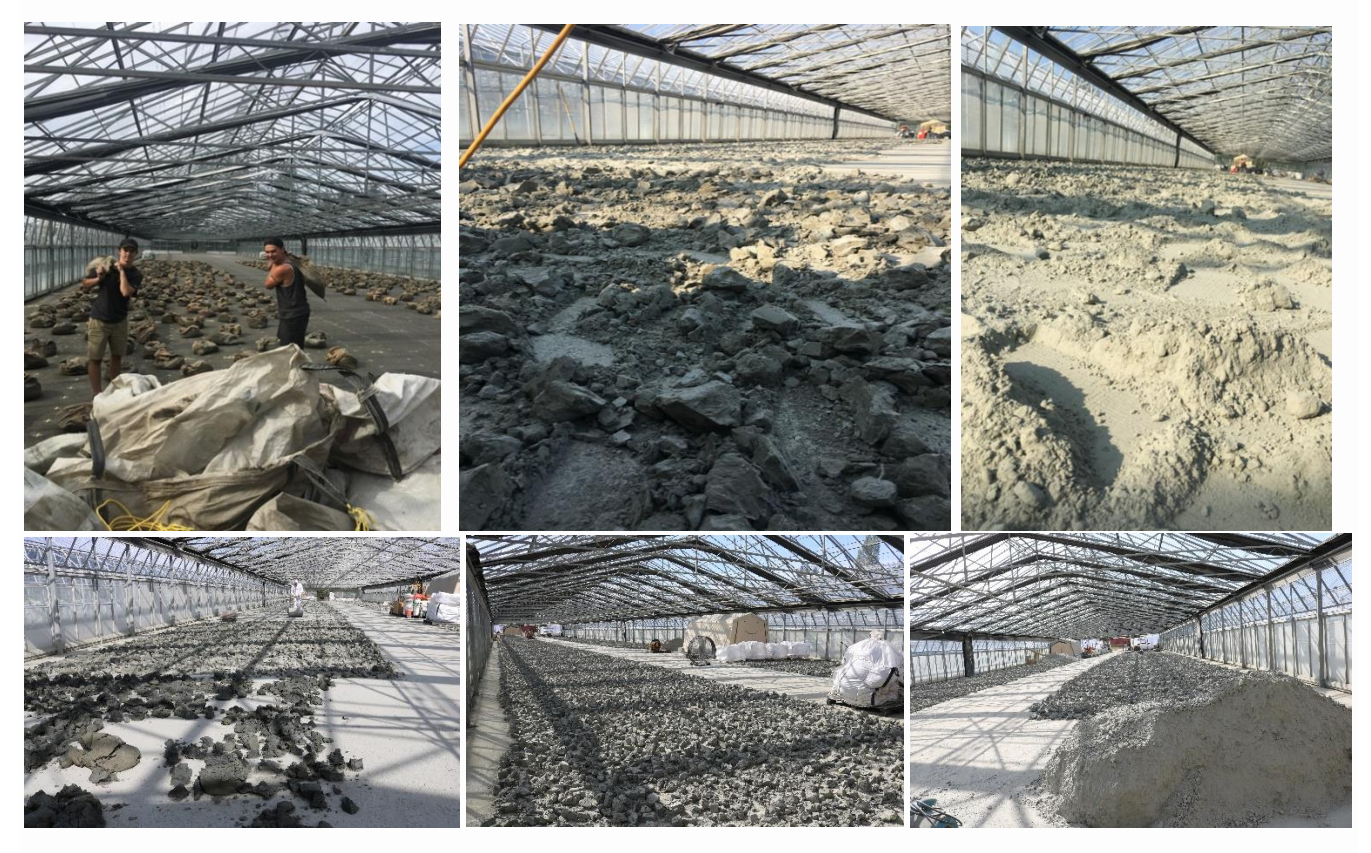
Unpacking burlap sacs Clumps are slowly reduced to a fine powder using our propriety process

Our clay is harvested in partnership with our local Indigenous First Nations as some of our proceeds go back to protect the grizzly bear habitat and fish hatcheries in our local area. The clay totes are transported back to our Processing Facility using transportation barges and trucking companies that are empty backhauling back to their original destination, to minimize our carbon footprint.