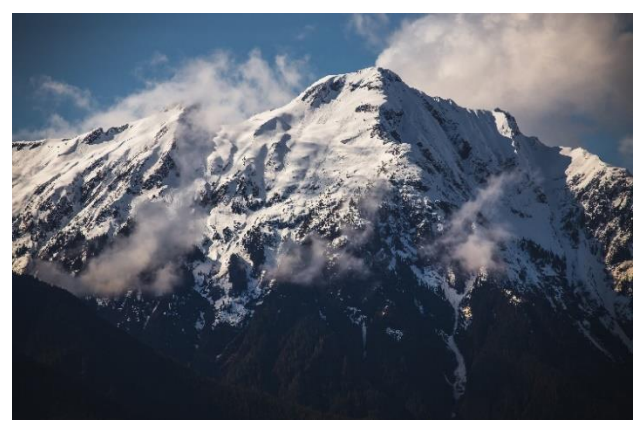
The Highest Peak and largest Glacier overlooks the Company's mineral claims

Glacial marine clay can only be a superior product if the region of erosion can supply large amounts of minerals and elements that are required for good health and well being. Glacial Bay Organic Clay's deposits have large amounts of these key ingredients making it one of the purest and most highly enriched clays available on the market today.