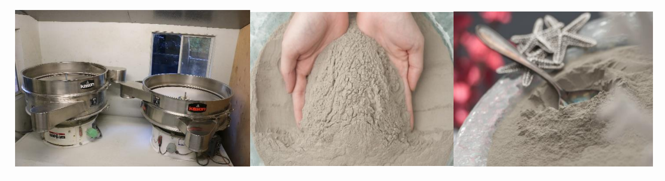
Organic material, sand and larger particles are all screened out to produce an Ultra-fine Clay

Mother nature takes over again, and the clay is solar dried inside large 15,000 sq ft greenhouses to a moisture content of below 1%, before the clay reaches our screening plant where sand, debris and organic material are screened out. The resulting clay particle size is then screened to an average size of 10-20 microns depending upon customer's requests; (the size of talcum powder or icing sugar).